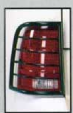
Expedition Part #13861