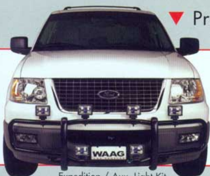
Expedition / Aux. Light Kit Part #18357/#10100 (3 pair shown)

Bolt on installation ▼ No cutting or drilling ▼ Heavy duty construction ▼ Protective vinyl molding ▼ Powder coat finish ▼ Ships UPS