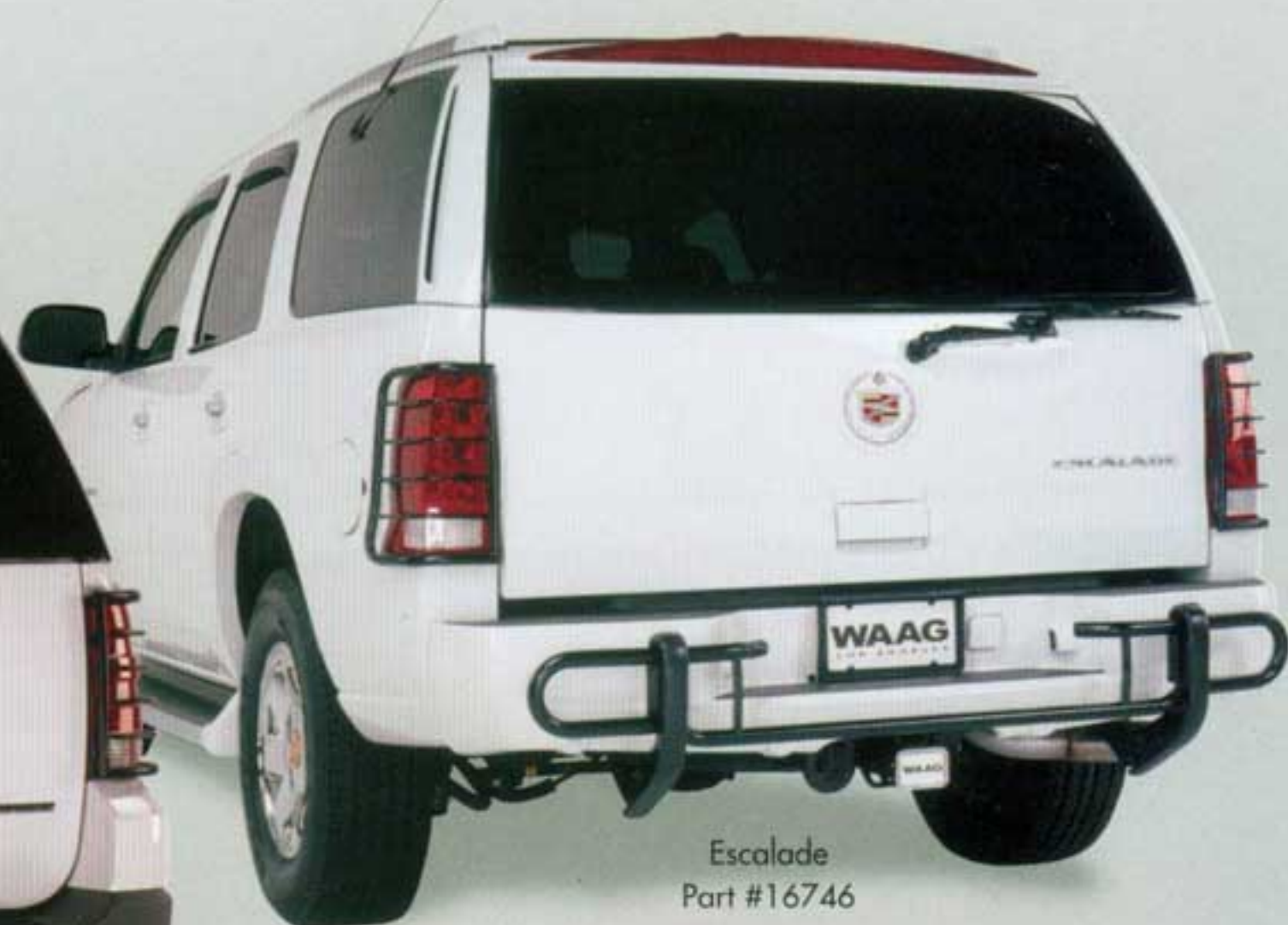
Escalade Part #16746