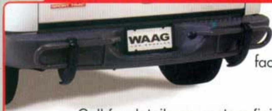
Sport Trac in factory-matching gray finish Part #16728GY