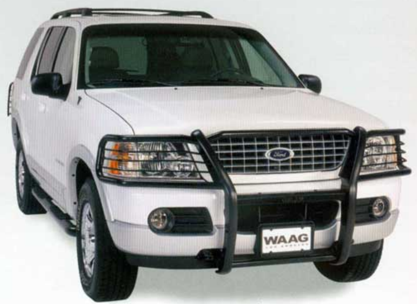
Explorer Part #15820