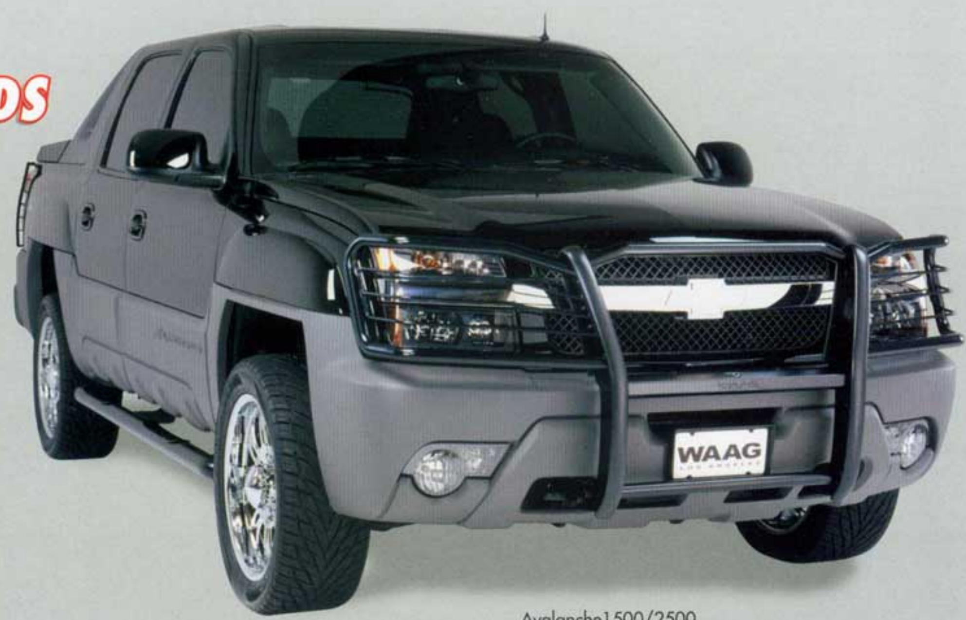
Avalanche 1500/2500 Part #15835/15848