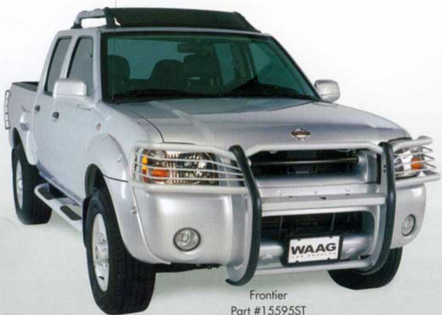
Frontier Part #15595ST Available in factory matching Silver Texture (shown), Charcoal Texture or Satin Black finish.