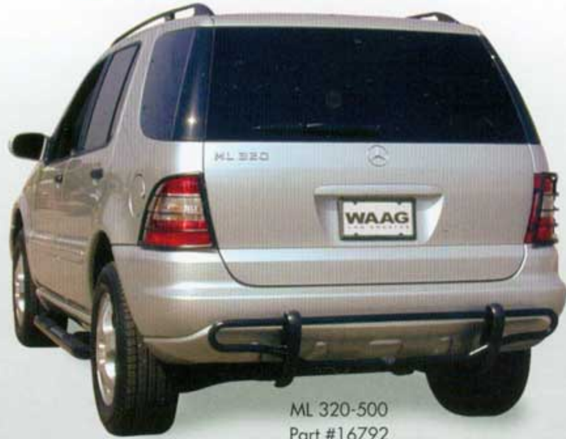
ML 320-500 Part #16792