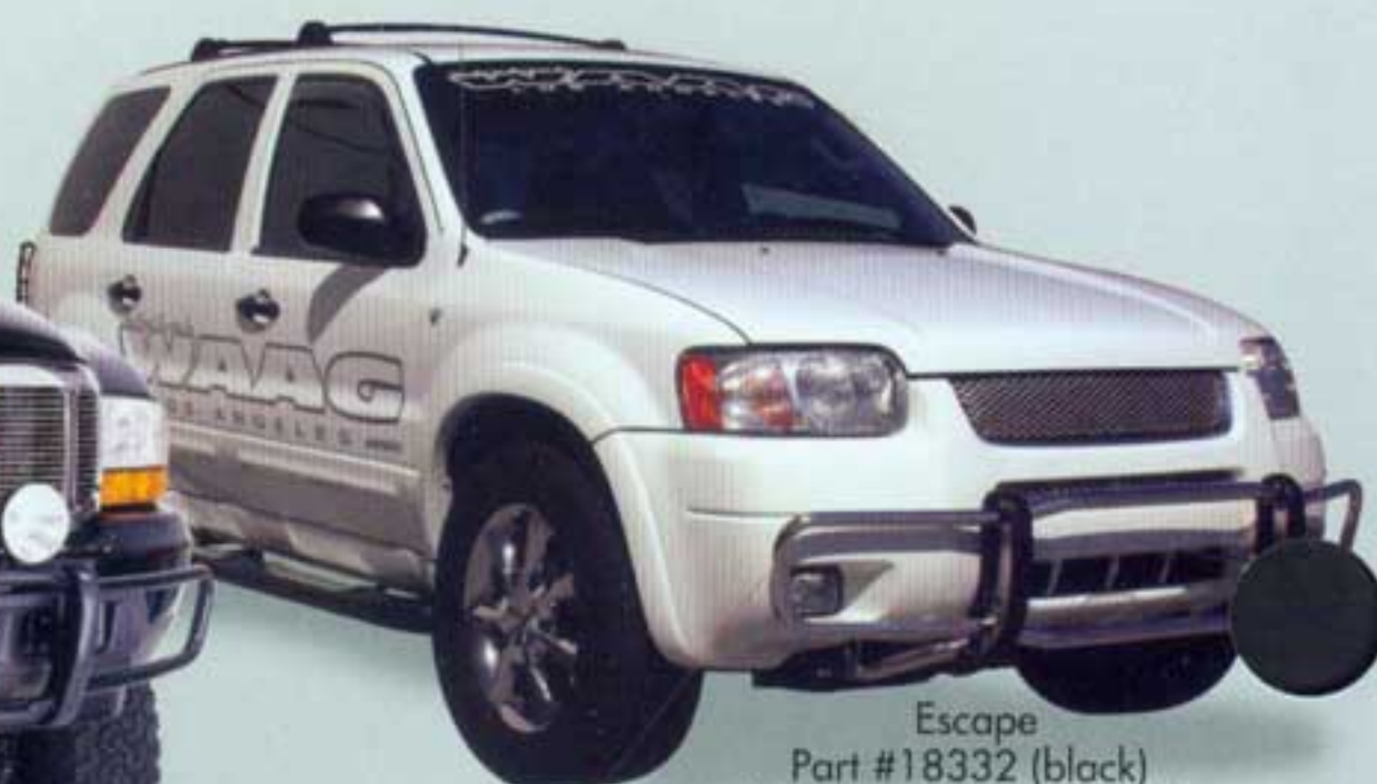
Escape Part #18332 (black) Call for stainless part numbers.