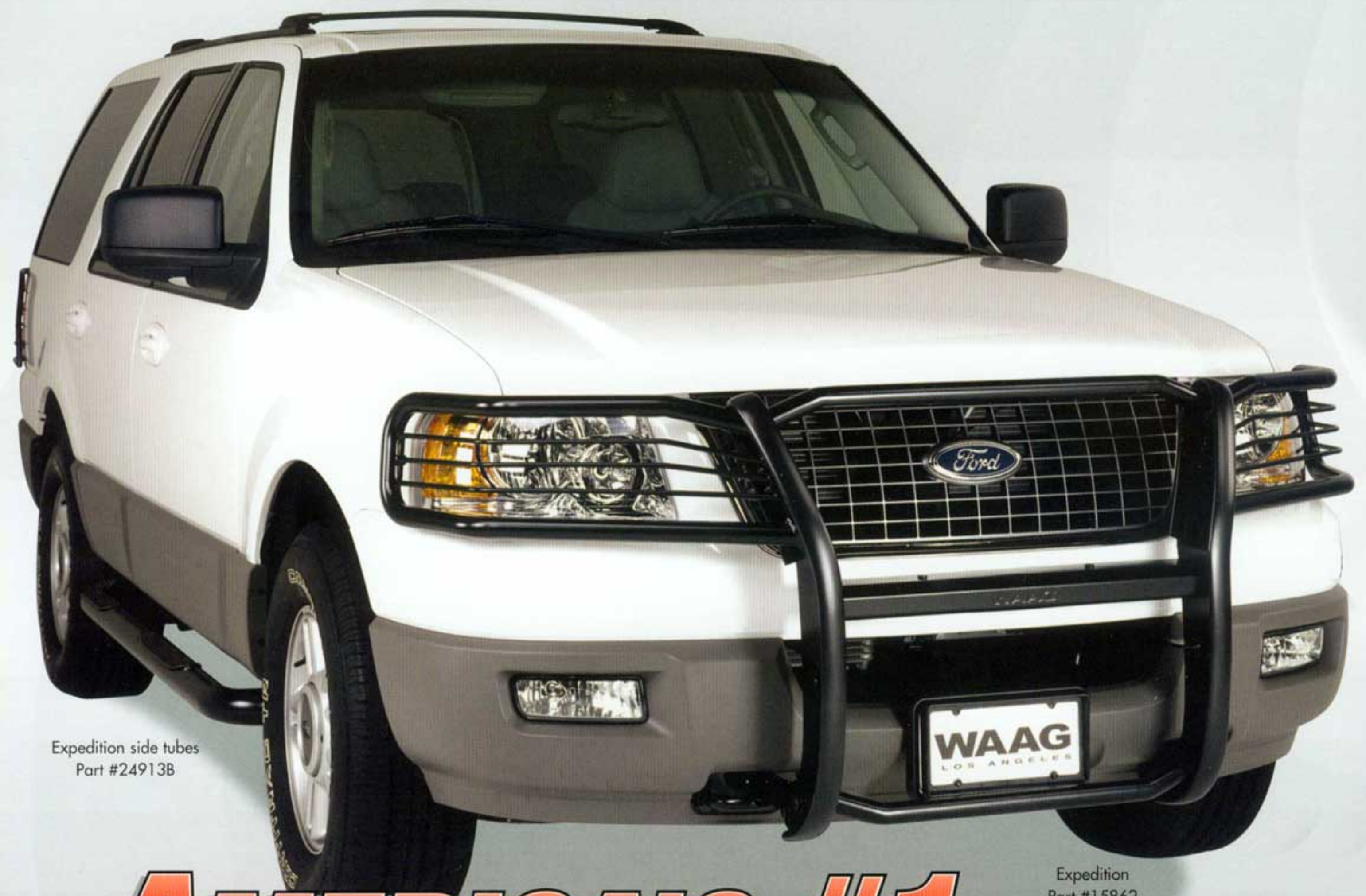
Expedition side tubes Part #24913B