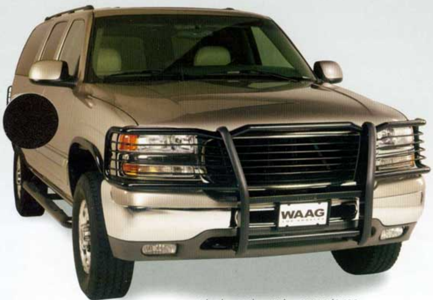
Suburban-Tahoe-Yukon 1500/2500 Part #15517/15556