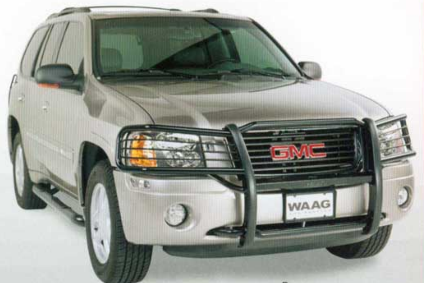
Envoy Part #15845