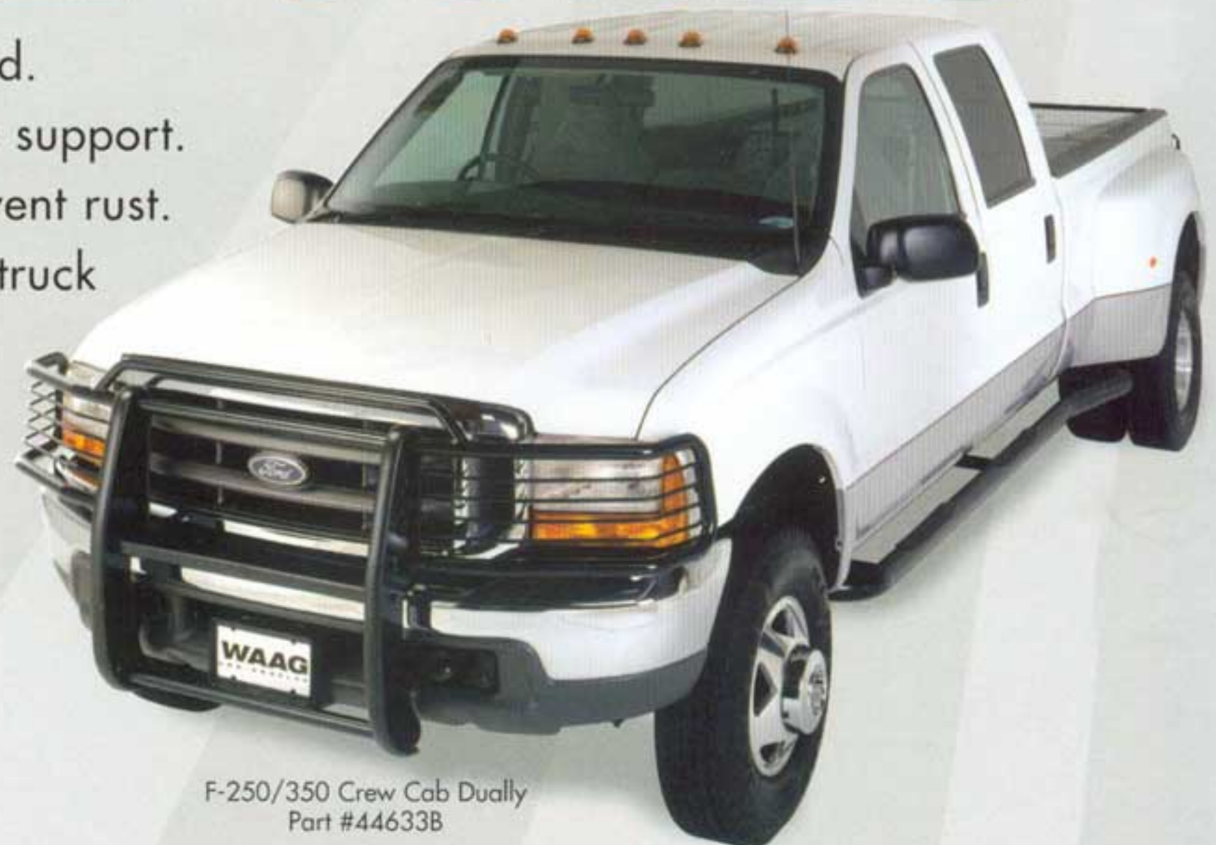
F-250/350 Crew Cab Dually Part #44633B