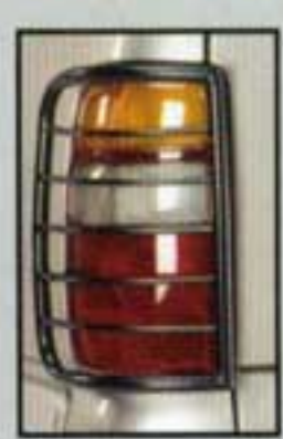
Suburban Part #13579