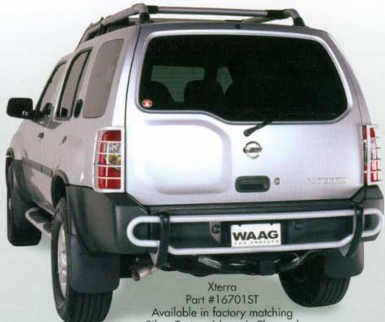
Xterra Part #16701ST Available in factory matching Silver Texture (shown), Charcoal Texture or Satin Black finish.