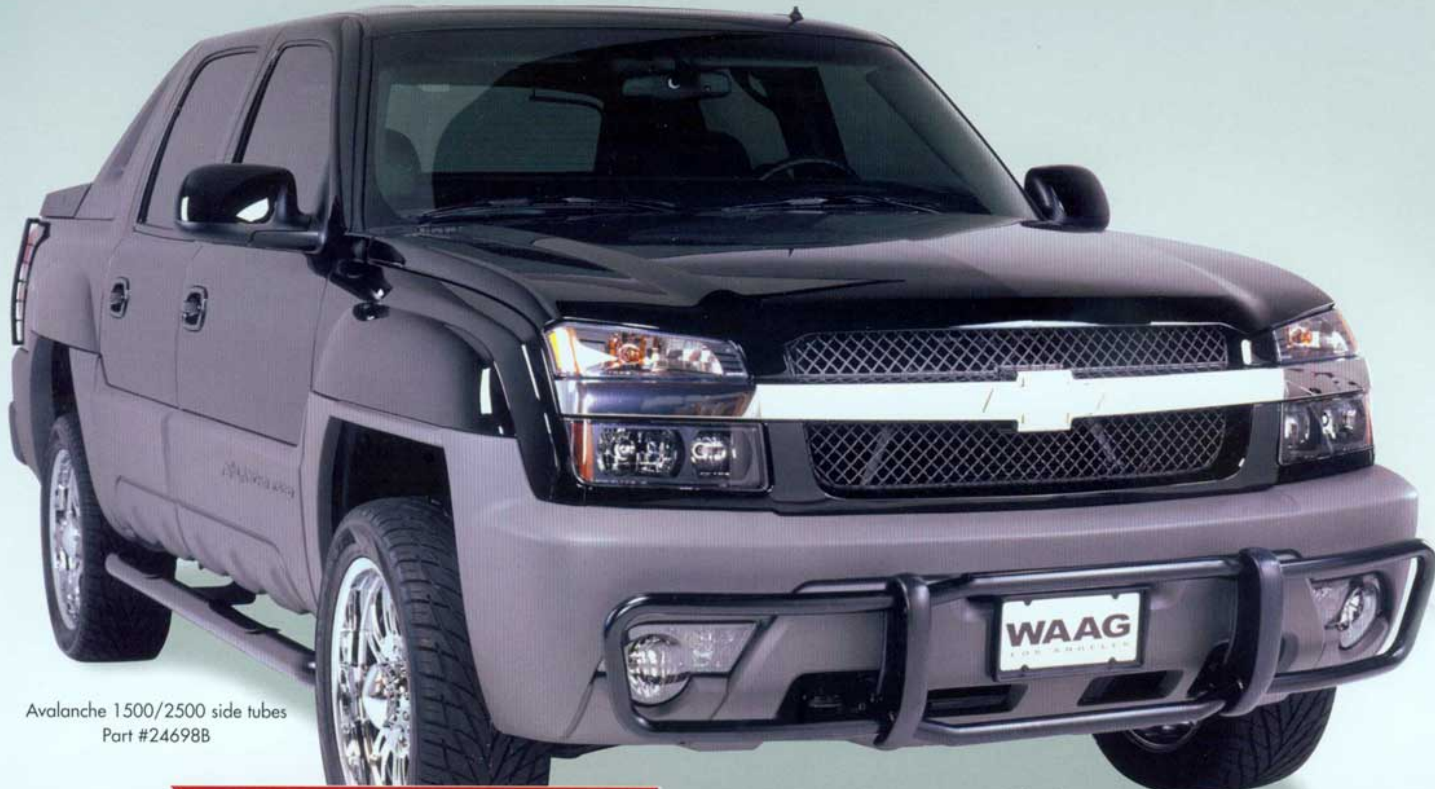
Avalanche 1500/2500 side tubes Part #24698B