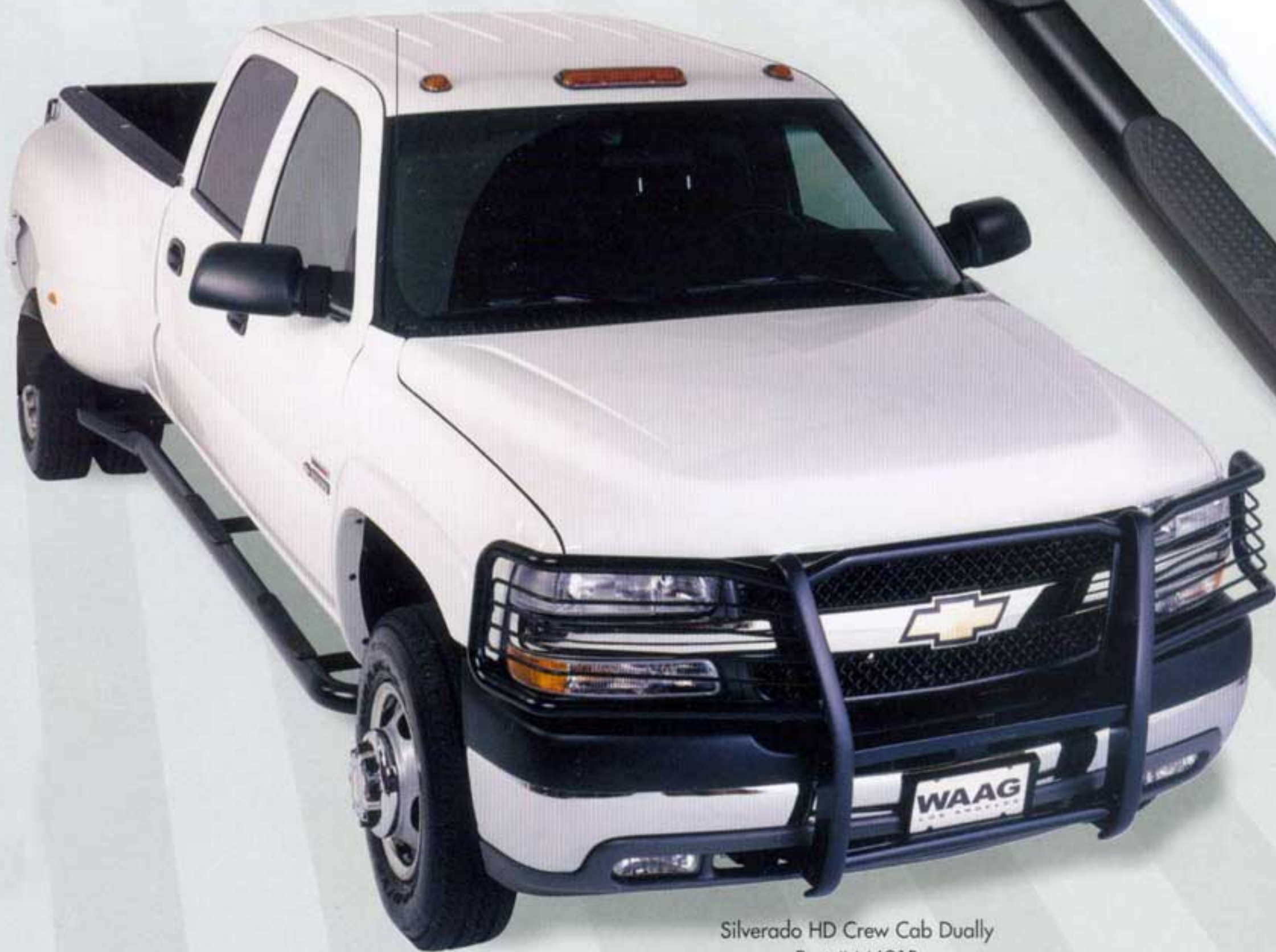
Silverado HD Crew Cab Dually Part #44691B

The only wheel-to-wheel side tube for duallys that flares out at the rear to follow and protect the rear fender . . . . . . also, Kickouts™ are always frame mounted for maximum strength.