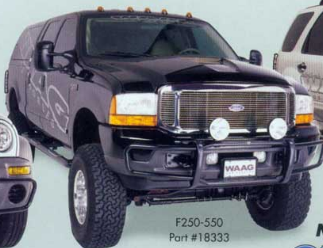
F250-550 Part #18333