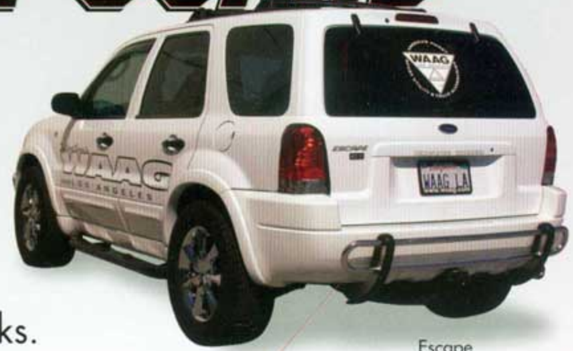
Escape Part #16736 (black) Call for stainless part numbers.