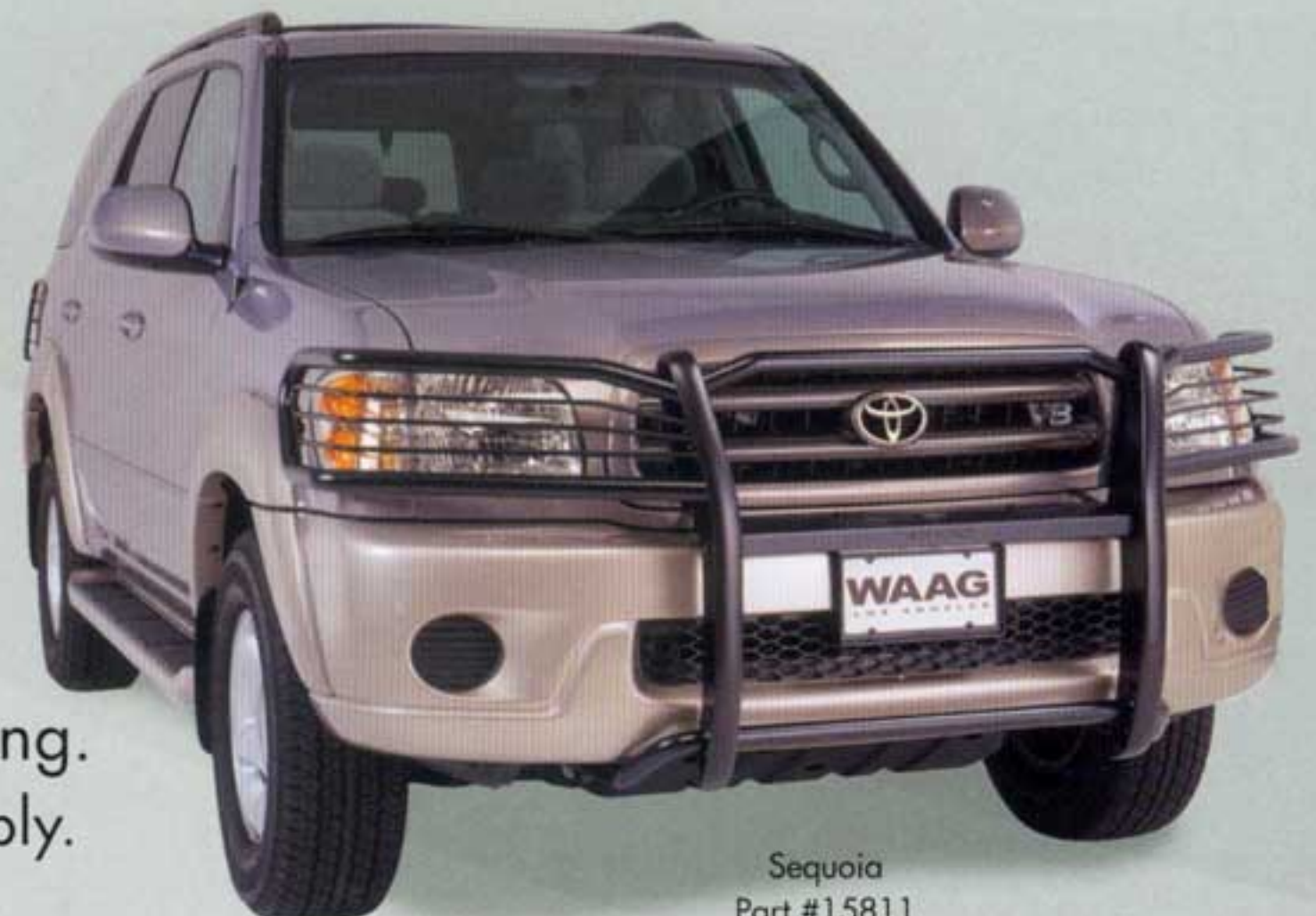
Sequoia Part #15811

* — Excludes '84-01 Cherokee, '91-'94 Explorer; ** — Excludes '84-01 Cherokee, '96-'99 Pathfinder