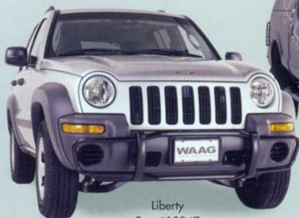
Liberty Part #18347