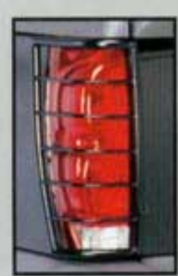
Avalanche Part #13860