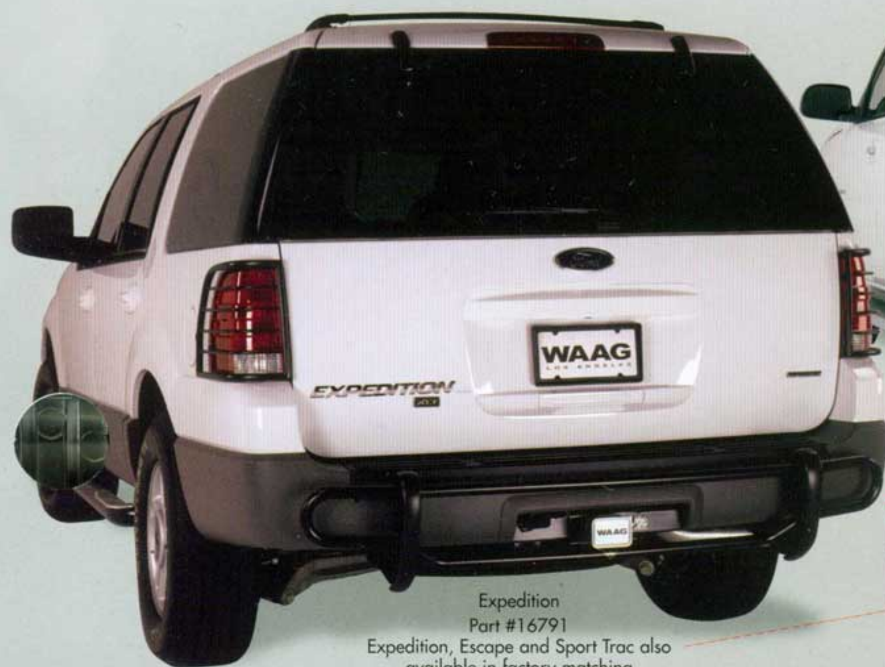
Expedition Part #16791 Expedition, Escape and Sport Trac also available in factory matching Ford gray finish.